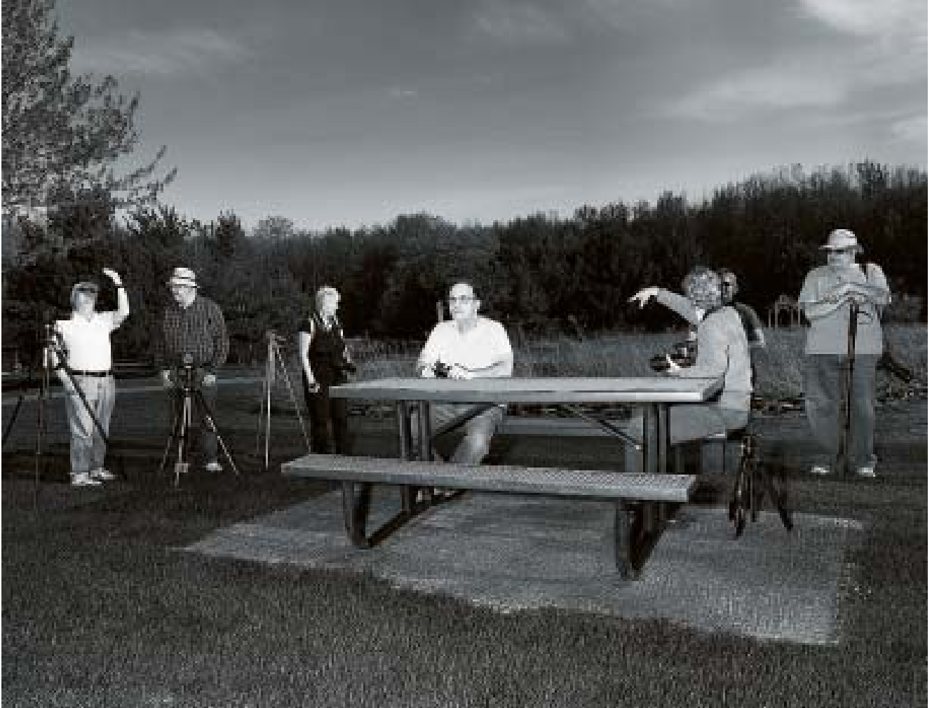
P40-42: MAGNUM PHOTOS