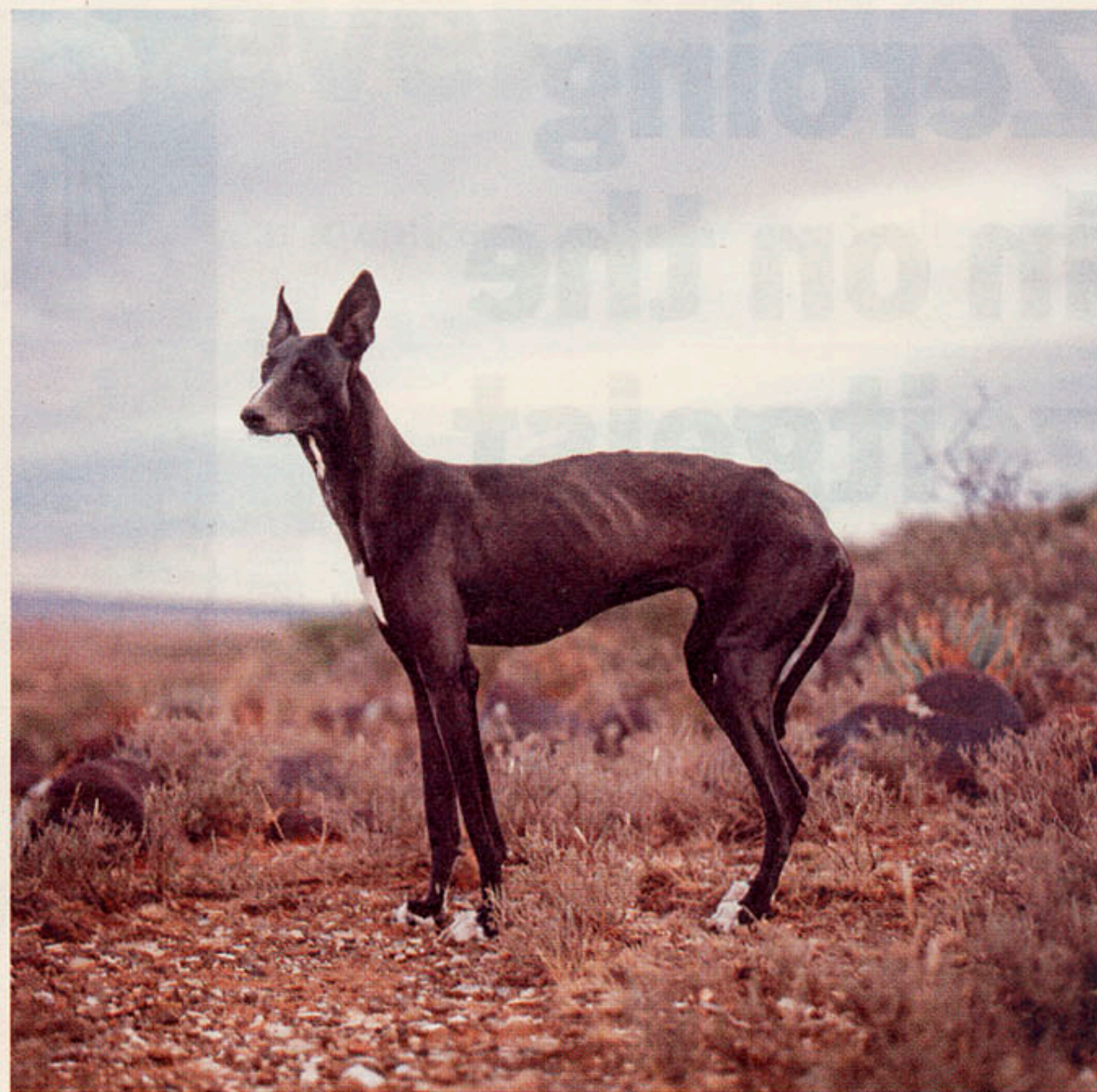
Left: Africanis 3, Strydenburg, April 1 2008; right: Africanis 1, Strydenburg, March 31 2008