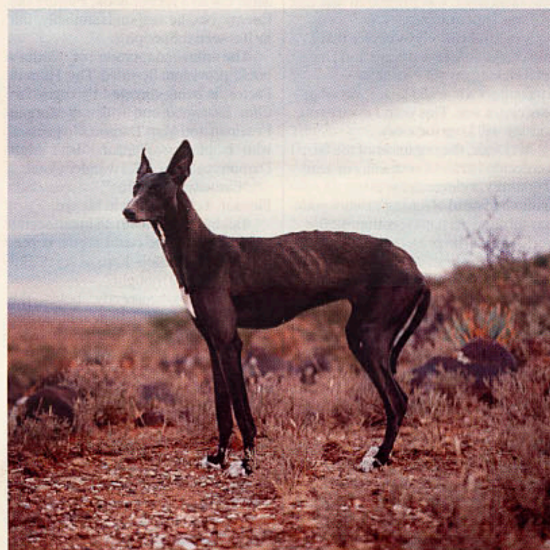
Images from Daniel Naudé's Africanis series. Left: Africanis 3, Strydenburg, April 12 2008. Above: Africanis 1, Strydenburg, March 31 2008